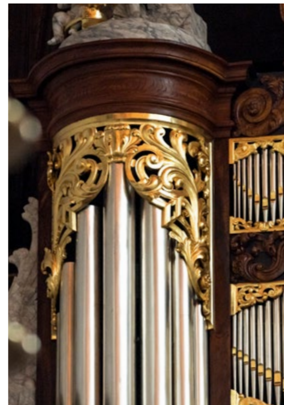
THE OUDE KERK