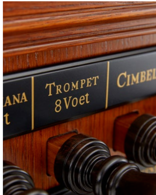
THE MONARKE AMSTERDAM

practical difference is the arrangement of the stops. Instead of four rows of eight stops, the Monarke Amsterdam features eight rows of four stops, bringing even the outer stops within the organist's reach. This means the organ offers the ultimate compromise between authenticity and optimum ease of use.